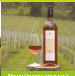
Albury Organic Vineyard's wine was served on the Royal barge 'Gloriana' during the Queen's Diamond Jubilee celebrations