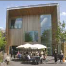
Award-winning Hogs Back Brewery has reintroduced hops to Surrey