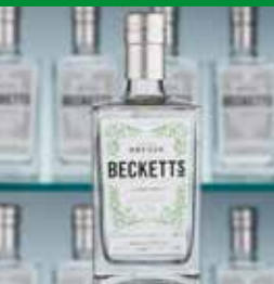
Beckett's, the only gin in the world infused with English juniper, is working with the National Trust and the Forestry Commission to save juniper from local extinction by repopulating Juniper Top on Box Hill