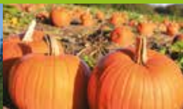
Garsons Farm, Esher - growing since 1871