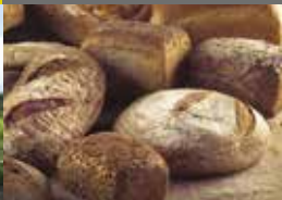
Chalk Hills Bakery, an independent artisan bakery using traditional methods