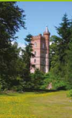
Painshill Park, a marvellous Georgian landscape garden