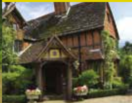
Luxury hotel, Langshott Manor, in award winning gardens