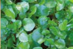
Watercress has been grown at Kingfisher Farm since 1854